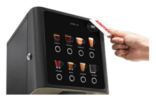
RFID Reader Kit For product recharge card or cashless systems