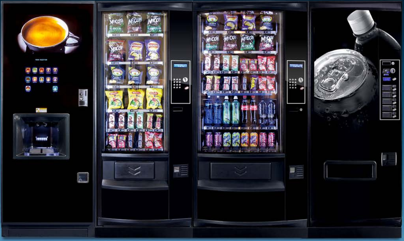
Shown in Neo ebony gloss finish